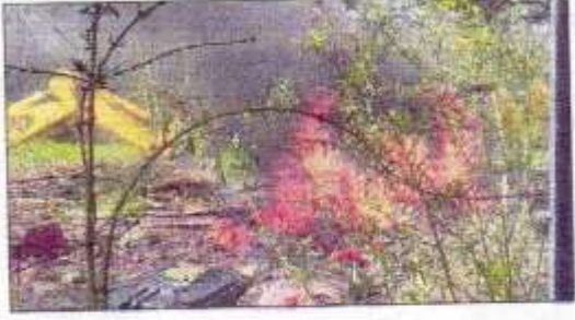
RISK: Ron says gas canisters were dumped near this fire.

Problems raised by the residents include water supplies be-